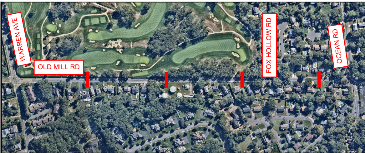
OLD MILL ROAD - SOUTH SECTION ( 4 CURRENTLY CONTEMPLATED LOCATIONS )

WHO: Borough of Spring Lake Heights in collaboration with Dynamic Traffic, LLC